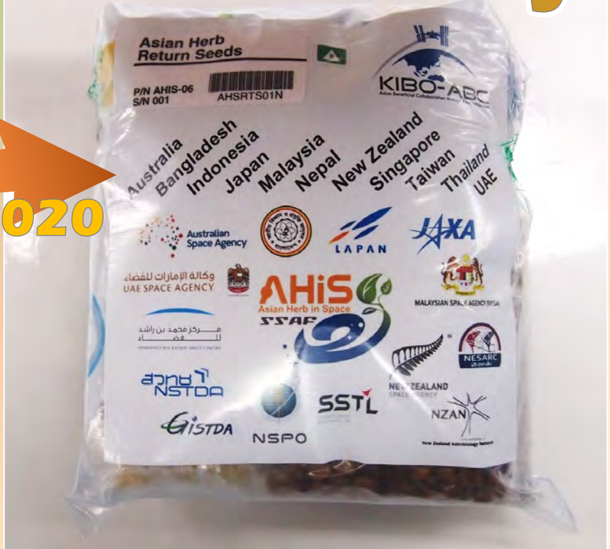
The seeds were stored in one bag with logo paper