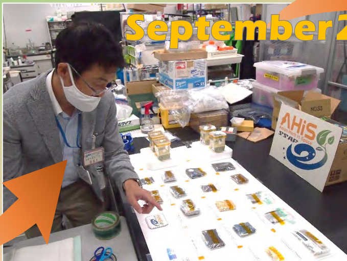
Inspection by Plant Quarantine officer at JAXA